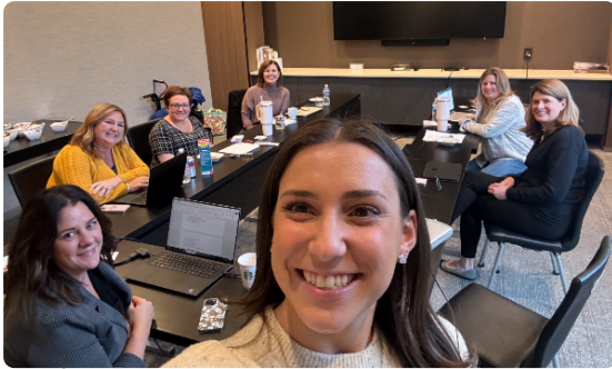
Edge Summit 2024 in Minneapolis